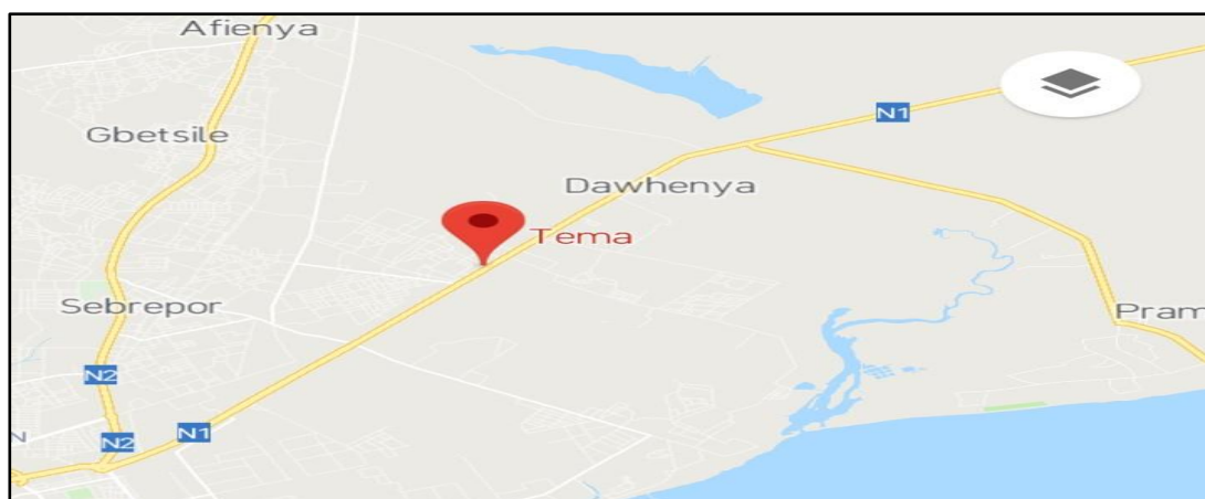
Figure 2: Aerial Map of Tema Metropolis Showing the Study Area

Research Design : The study adopted the explanatory mixed method approach to facilitate the achievement of the stated objectives of the study. The explanatory mixed method is also known as the sequential explanatory (Creswell, 2012). It occurs in two distinct interactive phases. This research design starts with the collection and analysis of quantitative (numeric) data, which has the priority for addressing the study questions. This beginning stage is accompanied by the subsequent collection and analysis of qualitative (text) data. The second, qualitative phase of the study is designed so that it follows from the results of the first, quantitative phase (Creswell, 2012). The rationale for this approach is that the quantitative data and their subsequent analysis will provide a general understanding of the research problem (Creswell & Plano-Clark, 2007; Creswell, 2009). According to Denscombe (2007) researchers can improve their confidence in the accuracy of findings through the use of different methods to investigate the same subject.